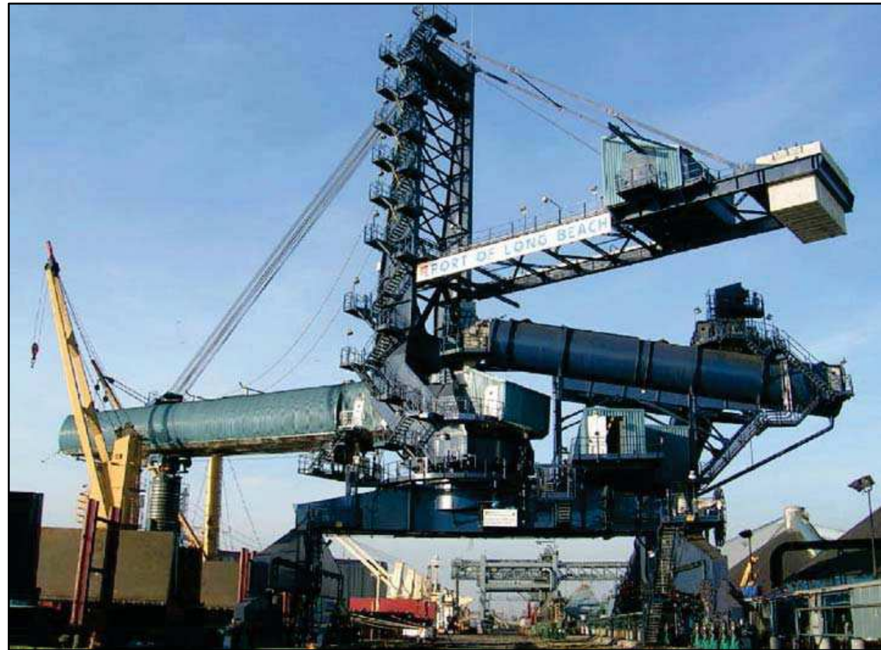
Completely Enclosed Shiploader